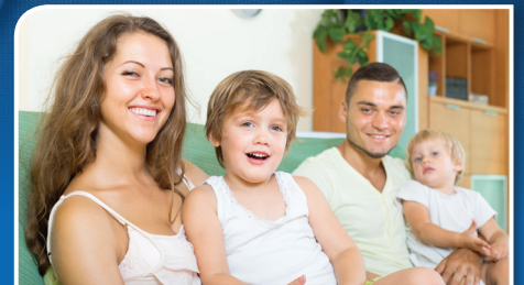
Only Labor Will Protect Your Family