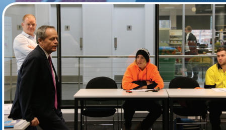
Q&A With Bill Shorten