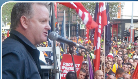
A Message To Members From The Federal Secretary