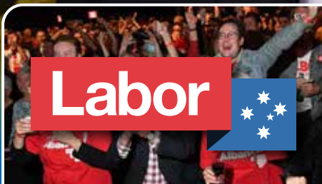
LABOR GOVERNMENT ELECTED!