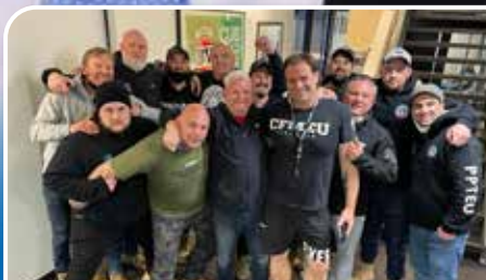
SOLIDARITY. COMRADESHIP. UNITY.